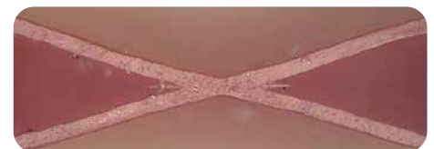
nyloprint® WS 73 Digital