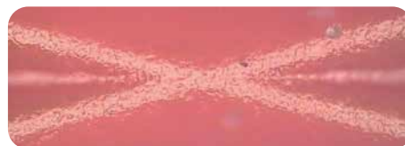
nyloprint® WS 73