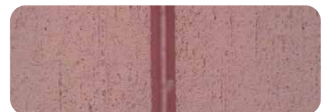
nyloprint® WS 73 Digital