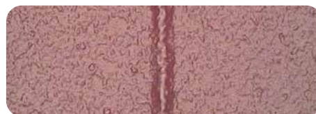
nyloprint® WS 73